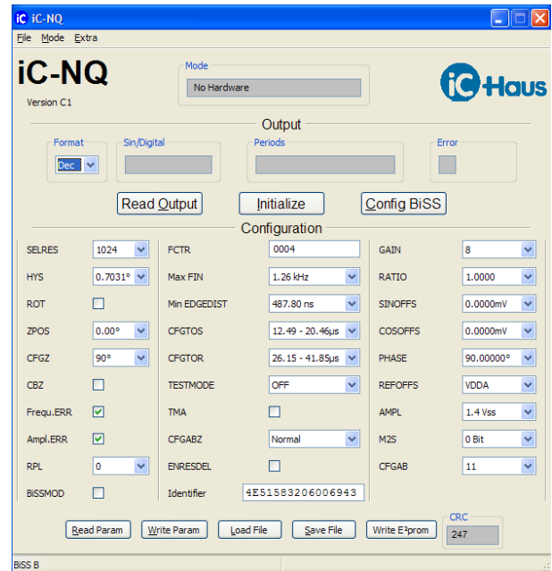
Figure 3: GUI Screenshot

"Bi-Directional" or "EPP" (eg. under Win NT) must be selected in the BIOS for the bidirectional operation of the parallel interface. Setting the BIOS to "Normal" alone is not sufficient. Typical DMA settings are: ECP DMA select 3, on-board parallel interface address 378h with interrupt Q7. These steps are not required when using the USB adapter iC-MB3 iCSY MB3U.